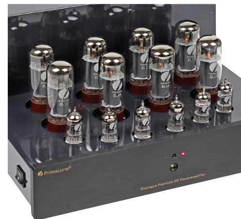
For high power, the output stage uses parallel push-pull pairs of EL34 power valves on each channel, seen at rear.