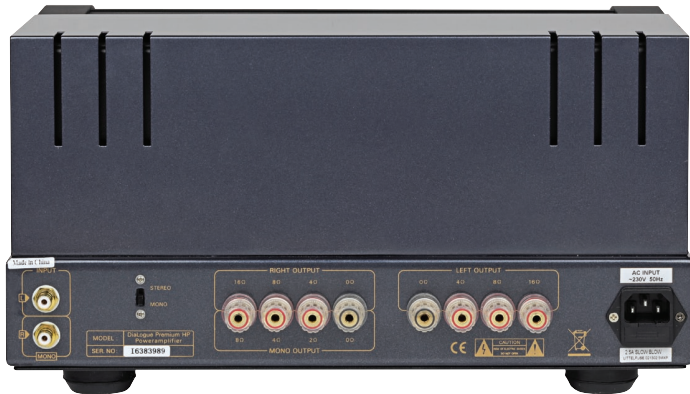
The stereo power amplifier has 4, 8 and 16 Ohm loudspeaker outputs, via sturdy gold plated terminals that accept 4mm banana plugs, spades or bare wires.

EL34 power valves in push-pull pairs, four per channel – eight in all. I mention this because valve replacement cost is an issue for some, as it can be if you're looking at 300Bs, for example, that cost up to £300 apiece. EL34s are plentiful and can be had at £60 or thereabouts for matched quads (i.e. 4), so a complete re-valve after 2000 hours or so – many years of use – is around £120.