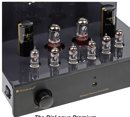
The DiaLogue Premium Preamplifier has two valve rectifiers, seen at rear.