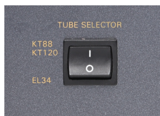
A side-mounted rocker switch changes bias to suit EL34s, KT88s and even KT150s PrimaLuna say.

I paired the PrimaLunas with Quadral's new Rodan 9 floorstanding loudspeakers reviewed in this issue, as well as our in-house Martin Logan