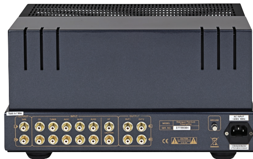
Line inputs through gold plated RCA phono sockets adorn the rear panel of the preamplifier and there are twin outputs.

Nigel Kennedy's Stradivarius had a lovely breadth of character, from resonant body to the rich, dense sound of the strings; this amplifier makes most others sound bleached in comparison. Nigel seemed to fiddle in space, as it were, as a lovely sense of atmosphere pervaded the performance supplied by ambience